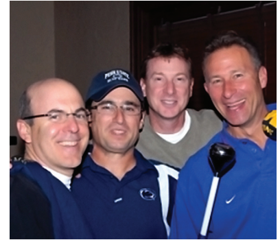
Alumni celebrate at Homecoming 2010.

For more information and to register, download the Homecoming 2011 Registration Form at www.betasigmabeta.com .