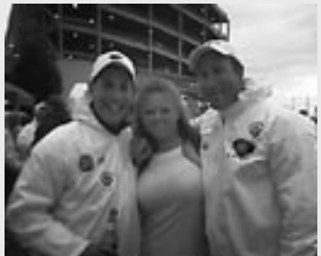
On our journey, dressed in our full white out gear, we obliged requests for pictures (Many thought we were '70s versions of the two knuckleheads in Night at the Roxy.). ESPN Game Day voted us best dressed after an extensive interview.

to our preference complemented with an assortment of red wines from California to Australia to tickle our pallets. Before entering the game, Dirt promised us dessert at a post tailgate if we cleaned up before kick-off. Of course, Rick and I consented before realizing that the cleanup included him and his friends' soiled diapers!